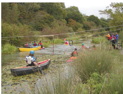
Members of North Avon Canoe Club enjoyed a slalom course when they held an activity day at Templars Firs.

Mapping by GEOprojects (UK) Ltd. Tel: 0118 939 3567 8 Southern Court, South Street, Reading, RG1 4QS Copyright Wilts and Berks Canal Trust: June 2008 Reg. Office: 117, High Street, Wootton Bassett, Swindon SN4 7AU Reg. in England & Wales No: 2267719. Reg. Charity No: 299595 Websites: www.wbct.org.uk www.geoprojects.net