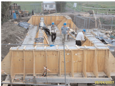
Volunteers constructing wooden shuttering ready for making the concrete walls of Chaddington spillway.

People enjoy the canal in many different ways - working, walking and enjoying the wildlife, and getting onto the water.