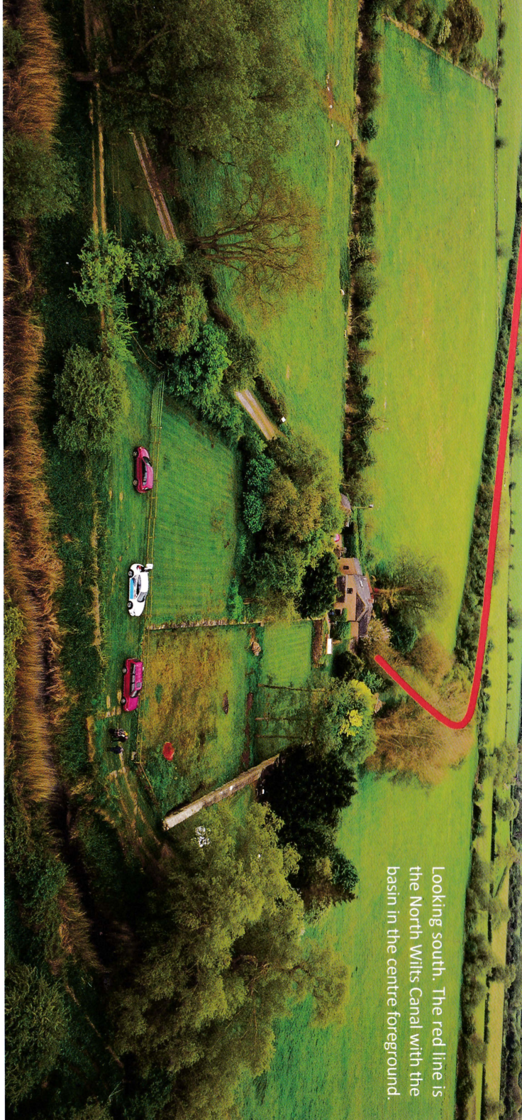
Looking south. The red line is the North Wilts Canal with the basin in the centre foreground.